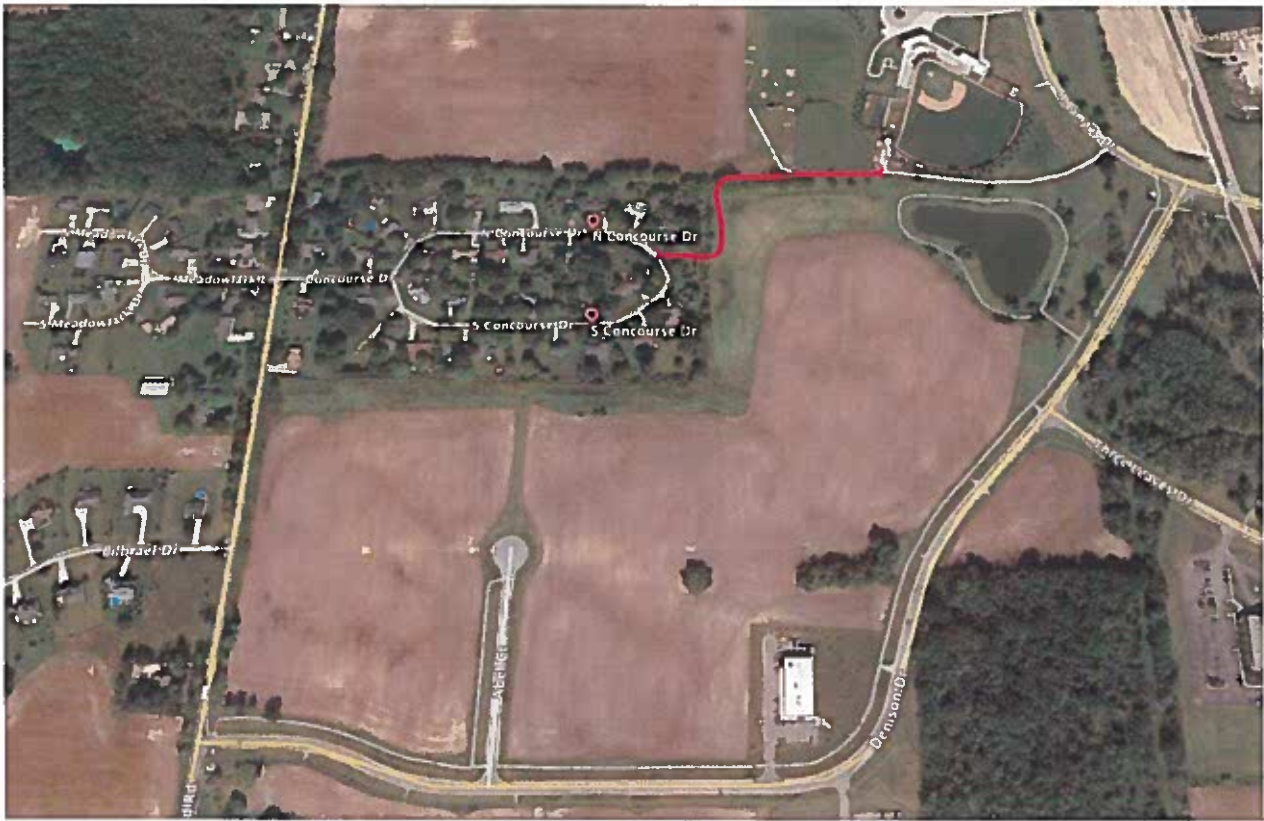
Another example: Scully Rd – McDonald Drive – Jacobs Trail connector