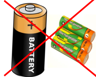
Batteries of any kind