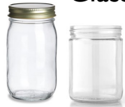
Clear Glass Jars only

Glass: Clear glass bottles and jars (throw away lids and caps, rinse). Recycle metal lids.