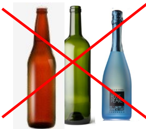
Brown, Green or Blue Glass