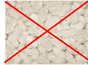
"Peanut" packing pieces